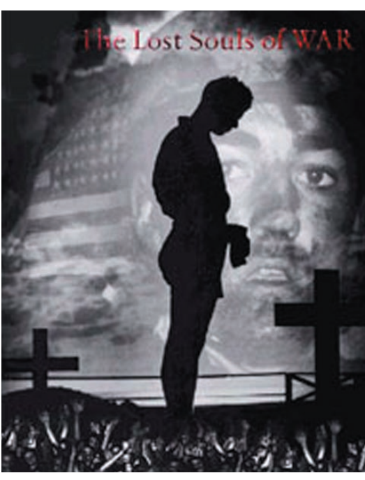
None of the "Justice Project" finalists dealt with Bush's conception of justice.

The website's gallery features the young winners in video, animation, and graphic design medias. Featured are a pro-life animation clip, a lot of anti-gun and anti-nuclear graphics, clips that request the