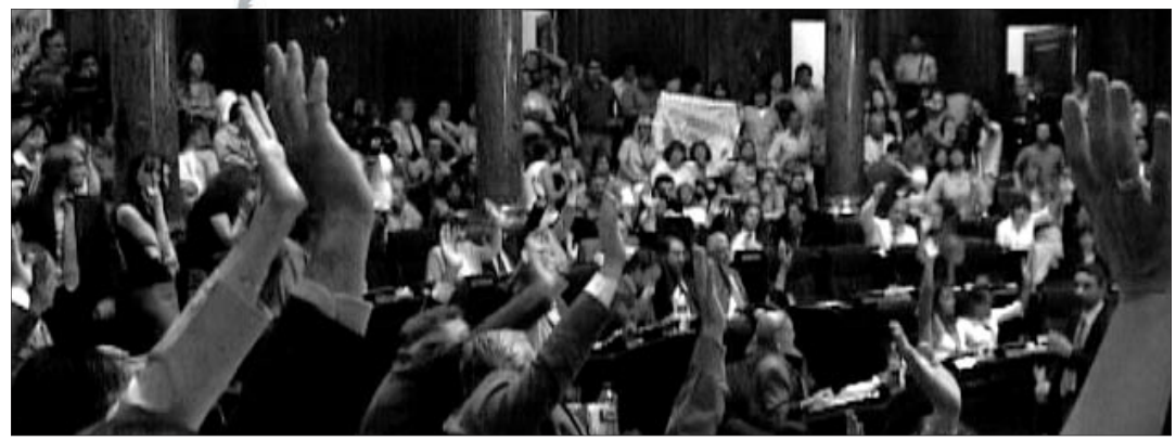
Argentinian lawmakers vote to turn over the Buenos Aires Brukman factory to its workers.

CANADA'S GRASSROOTS NATIONAL NEWSPAPER • NOVEMBER 2003 • DOMINIONPAPER.CA • Vol. I, #10